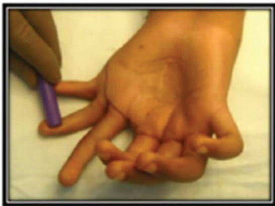
Fig. 2: Intra operative markings.

So, dorsal muscle with periosteal strip hitched to radial lateral band and palmar muscle mass attached to ulnar lateral bands. The third ray was abducted, pronated in desired position to serve as thumb function and fixed with K wires. The extra skin of fillet flaps was used for deepening of first web space. On follow up satisfactory hand function was achieved (Figure 3) which is supported by DASH (Disability of the arm, shoulder and hand) score. Total DASH score is 12.93.