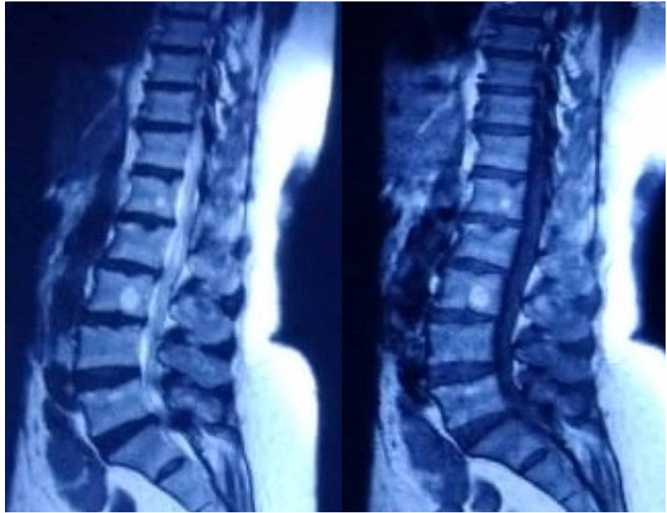
FIGURE 1: MRI of the lumbosacral spine without any significant findings