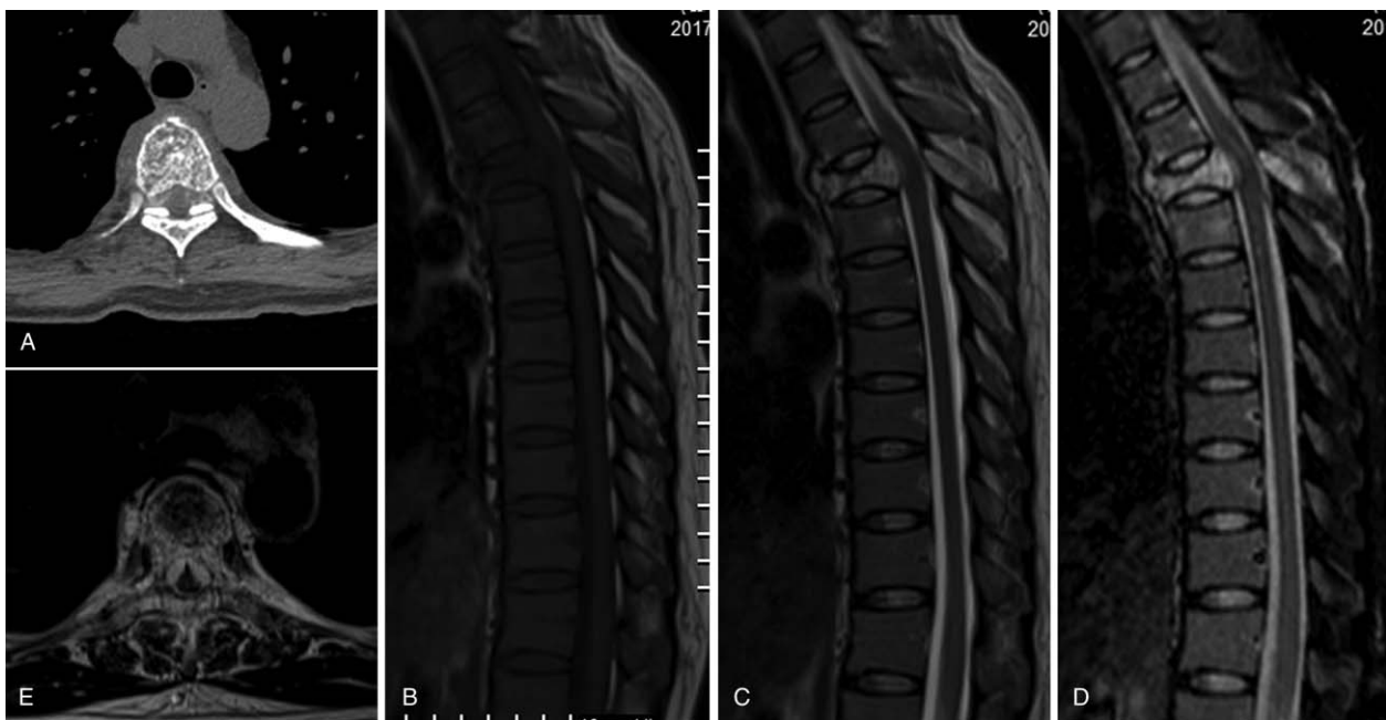
Figure 1. (A) Computed tomography shows sclerosis of the cancellous bone and a fracture involving the anterior cortex of the vertebral body. (B) Magnetic resonance imaging (MRI) shows a compression fracture of the T5 vertebra. (C) MRI shows T5 vertebral body compression in the dural sac and spinal cord. (D) MRI shows a hemangioma of the T5 vertebral body and hyperintensity of the spinous process. (E) MRI shows an extraosseous component of the hemangioma (arrow), indicating an aggressive vertebral hemangioma.

Compression fracture of an involved vertebra is infrequent because the hemangiomatous vertebra is reinforced by thick sclerotic vertical trabeculae from new bone formation. [5] Pathophysiologically, vertebral hemangiomas cause diffuse bone