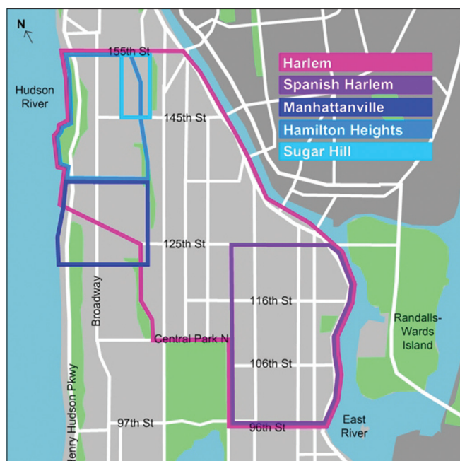
Figure 1: The Harlem community is a heterogeneous population that mimics the metropolitan nature of New York City. Within its boundaries, several large immigrant communities call this area home, including but not limited to Senegal, Côte d'Ivoire, Ghana, and Mali

from the African subcontinent to America, and has ultimately grown into a multiservice human rights agency that provides legal, social, and medical care to immigrants, refugees, and asylees in the African Diaspora. [10] Committed to challenging stigma and discrimination at all levels and supporting individuals, the ASC assists over 12,000 patients a year across its clinic sites and mobile outreach. [11] For the 2017-2018 health fairs, the ASC assisted TouroCOM with advertisement of the fair to the community in over 25 native African languages as well as performed hepatitis B and C screening with blood tests at the school. Undergraduate medical students assisted with registration, providing educational pamphlets, and setting up care continuity by giving directions for follow-up at the ASC clinic.