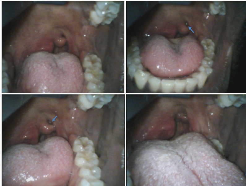
Fig. 3. Video laryngoscopy images of the patient's pharynx demonstrating a grey discoloration (arrow) of the left tonsil.

eye pain, and ear pain. He did not report additional symptoms beyond the ones previously stated.