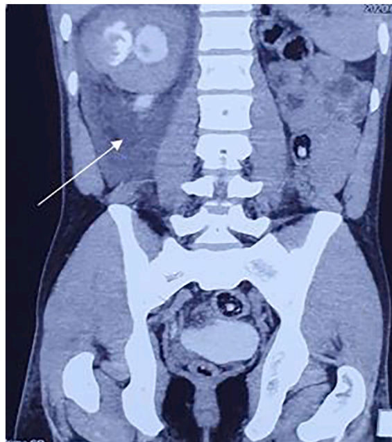
Fig. 3. Coronal CT scan showing significant urinoma formation on the right side extending inferiorly as far as the pelvic region (shown by arrow). Of note is the agenesis of kidneys on the left side.

and due to absence of specific guidelines in place, the decision to intervene is based entirely on clinician preference. Trauma surgeons usually decide to intervene by stenting early while urologists prefer a conservative approach in most cases [9]. Although most urinomas resolve spontaneously, large and medially located urinomas require some intervention to prevent complications such as page kidney, persistent hypertension, abscess formation and adhesion [10].