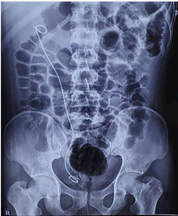
Fig. 4. AP radiograph after placement of a double-J ureteral stent.

commonly in males [11]. URA may lead to proteinuria in young patients [12]. This explains the presence of proteinuria in our case. The presence of solitary kidney is important to be considered in patients with high grade renal trauma. This is of importance as it may markedly affect the management decisions, weighing against the use of operative procedures like nephrectomy. In patients with anomalous solitary kidney with urinoma formation after renal trauma, early urinary diversion in the form of ureteral stenting may preserve renal function and prevent subsequent complications.