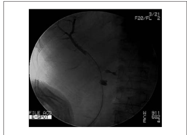
Figure 2 A soft guidewire is inserted into the sinus tract until it reaches the common bile duct.

Iohexol contrast media is injected with pressure through the cutaneous opening of the T-tube sinus tract. Post-contrast imaging helps to identify the location of T-tube tract (Fig 1). Using x-ray fluoroscopy, a soft guidewire is inserted into the sinus track until it reaches the common bile duct (Fig 2). A biliary balloon dilator is introduced along the guidewire and dilation is then performed. A 16F stomach tube is passed along the fistula into the common bile duct with the guidewire (Fig 3). Residual stones in the bile duct can be removed in the following 1–2 weeks using choledochoscopy.