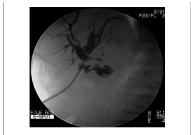
Figure 3 The T-tube sinus tract, intrahepatic ducts and common bile duct following fistula dilation and insertion of a stomach tube along the guidewire.