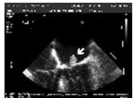
Figure 2. The transoesophageal echocardiography showing one of the two large vegetations (one was 1.6 \times 1.1 cm, arrow) on the posterior leaflet of mitral valve with associated complex severe mitral regurgitation.

From the limited data available, S. dysgalactiae seems to infect left-sided native heart valves after gaining entry through the skin and is associated with a high prevalence of complications. In the current case, the primary source of infection was most likely the non-healing ulcers on the feet and the associated chronic osteomyelitis leading to more invasive infection. The current literature suggests an association between group G streptococcal bacteraemia or other invasive infections and underlying immunosuppressive conditions such as diabetes mellitus, chronic alcoholism, cardiovascular disease and malignancies. 15