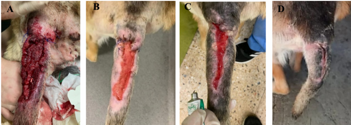
Fig. 4. Evolution of wound at the base of the tail from MVS_{T0} to MVS_{T4} . (A) Wound upon admission with MVS_{T0} > 15 . (B) Wound after surgical management (cleaning of necrotic tissue and approximation of edges). (C) Wound after 5 HBOT sessions with MVS > 10 and \leq 15 . (D) Wound after 10 HBOT sessions with classification MVS_{T4} > 5 and \leq 10 .