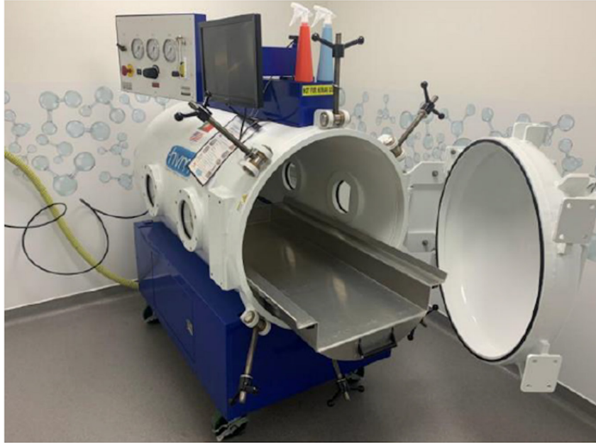
Fig. 2. Hyperbaric chamber model.

during the therapeutic process, followed by the treatment itself. In the final phase, the decompression was carried out, which lasted 20–25 minutes. This protocol was adjusted according to the daily clinical exam.