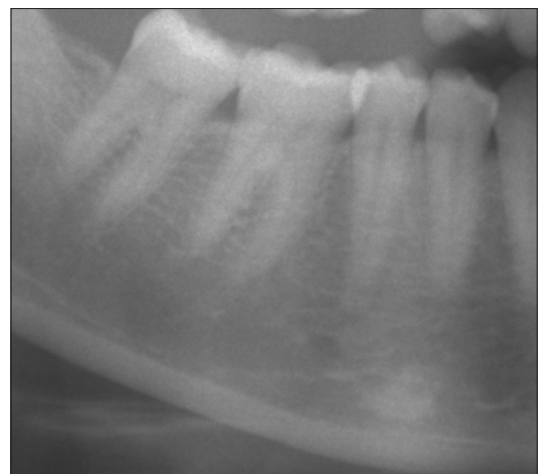
Figure 1: C1 category of MCI

MCI or KI refers to the appearance of the inferior cortex of the mandible and is classified as follows: C1: the endosteal margin of the cortex is even and sharp on both sides [Figure 1]; C2: The endosteal margin presents semilunar defects (lacunar resorption) and/or appears to form endosteal cortical residues on one or both sides [Figure 2]; and C3: The cortical layer forms heavy endosteal cortical residues and is clearly porous [Figure 3]. [17] Some studies have reported that women with a mild to moderate and severe eroded cortex are considered to have an increased likelihood of osteoporosis. [1,11,18-20] However, others indicated no usefulness of the MCI. [8,21,22] A recent study showed that approximately 95% of Japanese women identified by trained dentists using cortical shape findings did have osteopenia or osteoporosis. [14] As a result, studies concluded that the sensitivity of MCI in the diagnosis