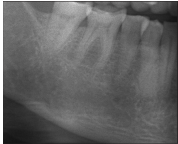
Figure 2: C2 category of MCI

PMI is the ratio between the cortical width at the mental foramen region and the distance from the lower border to the inferior edge of the mental foramen (MI/h) [Figure 4]. [37] A few studies investigated the accuracy of PMI in detecting reduced BMD. These studies considered the threshold value of 0.3 and the estimated sensitivity and specificity was higher than 70%. [8,20,38]