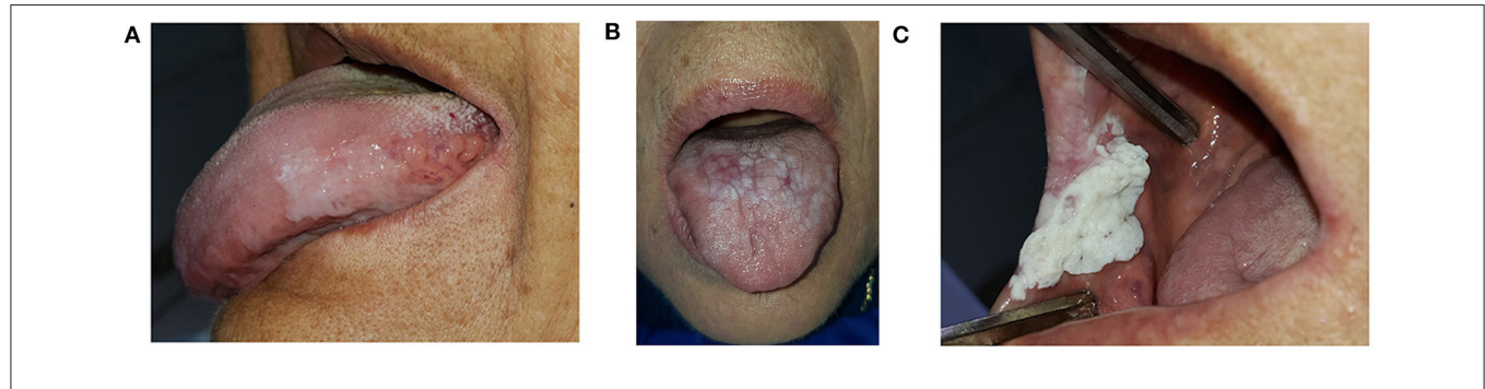
FIGURE 3 | Clinical morphology of OL. (A) Homogeneous leukoplakia. (B) Non-homogeneous leukoplakia. (C) Verrucous leukoplakia.