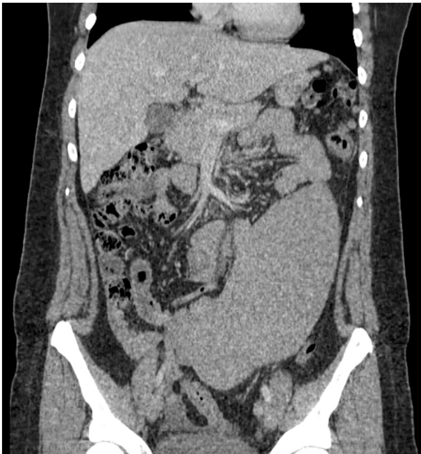
Fig. 1. CT scan showing splenomegaly with pelvic seat.

The tail of the pancreas was rotated on the right paravertebral seat with homogeneous enhancement. The splenic vessels rotated from the median seat to the right para-vertebral, and the artery was winding in a half-turn while remaining permeable. No radiological signs of torsion were found (Fig. 2). Due to the symptomatic splenomegaly, a laparotomy was performed. Steroid or any other medical treatment was not contemplated due to the WS. Examination of the abdomen cavity showed a voluminous spleen suspended only by its coiled pedicle in the pelvis with average rotation of the pancreas. However, the spleen pedicle was normal, with no sign of torsion. Other internal organs were normal. Because of the enormous splenomegaly and the patient's medical history, splenectomy was undertaken. The postoperative course was uneventful. The platelet count of 480 \times 10^3/\mu\text{L} . The patient was discharged seven days postoperatively. The pathological examination of the spleen concluded with an enlarged normal spleen. Pneumococcal, meningococcal, and influenza vaccinations were administered during the postoperative period. However, an increase in the platelet count was registered after three months, which required aspirin administration to