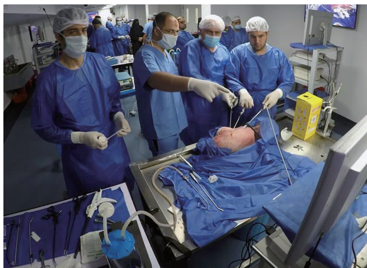
Figure 7 Junior surgeons during wet lab training session; Cadaveric VATS workshop (NTI, Cairo, Egypt. May 2018). VATS, video-assisted thoracic surgery; NTI, National Training Institute. This image is published with the participants' consent.

practice is interesting in Egypt as the cost of chest CT scan was as low as 25$ in private radiology centers, compared to 125$ for PCR, so we notice a high number of self-referrals to get a scan to exclude COVID-19 infection then consult a physician regarding abnormal findings and this has made a significant impact on the number of patients requiring surgery for accidentally discovered lesions but reports of this impact not yet been published. This comes contradictory with reports from several centers in the world that had an established LDCT lung cancer screening program reported that COVID-19 caused significant disruption in lung cancer screening, leading to a decrease in new patients screened and an increased proportion of nodules suspicious for malignancy once screening resumed (75,76).