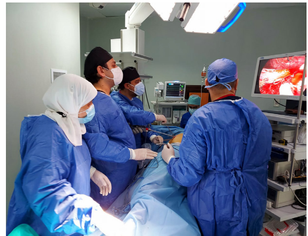
Figure 6 Adoption of new techniques; uniportal VATS (Assiut University Heart Hospital, Assiut, Egypt). VATS, video-assisted thoracic surgery. This image is published with the participants’ consent.

By turn, to train other willing thoracic surgeons,