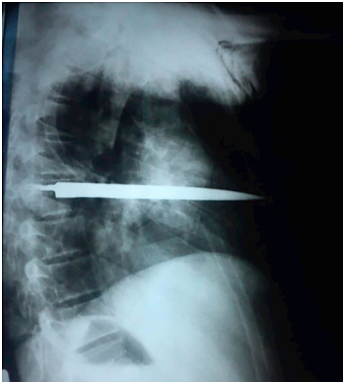
Figure 4 Lateral chest film: showing a whole blade of kitchen knife extending from spine posterior to just retrosternal anteriorly with the inserted chest tube (66).

to remove distally located FB in adults and children (52,56,58,59).