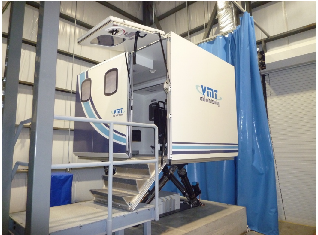
FIGURE 1: Forward exterior view of marine institute replica of Sikorsky S-92 designed by Virtual Marine Technology

to act as the tight space found in a medevac helicopter.