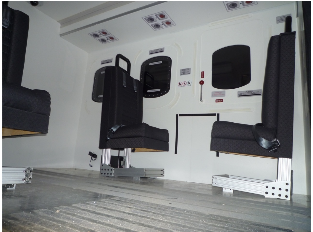
FIGURE 4: Interior view of marine institute replica of Sikorsky S-92 designed by Virtual Marine Technology

Technical staff program the computer and control the simulation when they are given the stepwise scenario (Table 1). Two confederates are recruited to act as an ER nurse and an advanced-care paramedic working with the medevac team. Alternatively, two family medicine or emergency medicine trainees could learn from the exercise by acting as these confederates. Figure 5 and Table 2 depict additional information to be provided if requested by the learner.