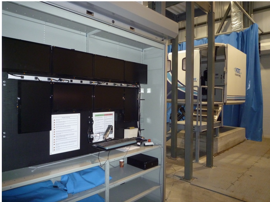
FIGURE 3: Control panel for marine institute replica of Sikorsky S-92 designed by Virtual Marine Technology