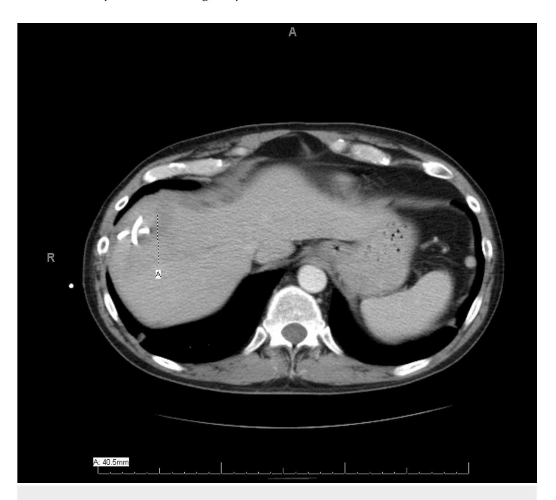
FIGURE 3: Repeat CT scan of abdomen and pelvis

the superior aspect of the liver suggestive of thrombosed superior right hepatic vein branch. No anticoagulation was started for treatment of the hepatic vein thrombus, as it was likely a pylephlebitis. Due to recurrent diverticulitis, three months after his hospitalization, he had sigmoidectomy with diverting loop ileostomy, which was eventually successfully reversed. Histopathological reports from the sigmoid resection during ileostomy and the reversal surgery did not show any evidence of malignancy.