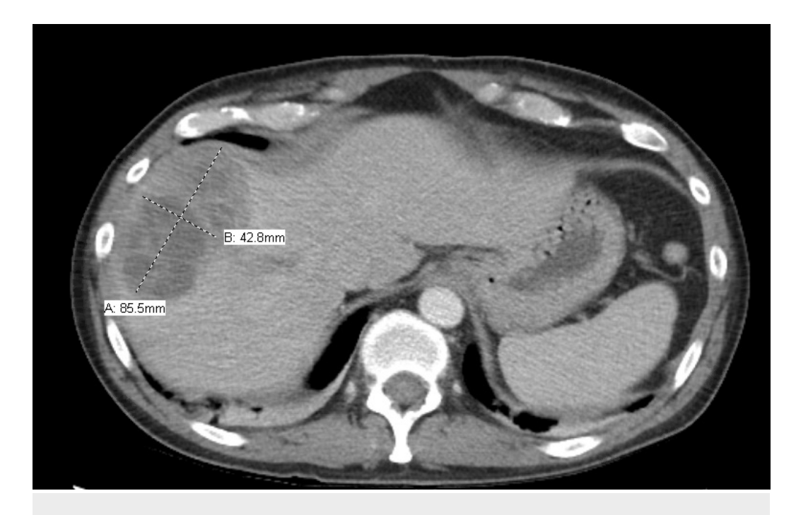
FIGURE 1: Initial CT scan of abdomen

right hepatic lobe medially anteriorly, multiple sigmoid diverticulosis without evidence of acute diverticulitis, and a superior right hepatic vein thrombus. He subsequently underwent a CT-guided fine-needle aspiration biopsy of the lesion, which showed a grossly purulent material, and a percutaneous drainage catheter was placed. Pathology was negative for malignant cells but showed suppurative inflammation with necrosis consistent with hepatic abscess. MRI of the brain was performed for weakness in the right arm. It showed diffusion-restricted, multiple ring-enhancing lesions with associated edema throughout the cerebrum, left > right, and the right cerebellum (Figure 2).