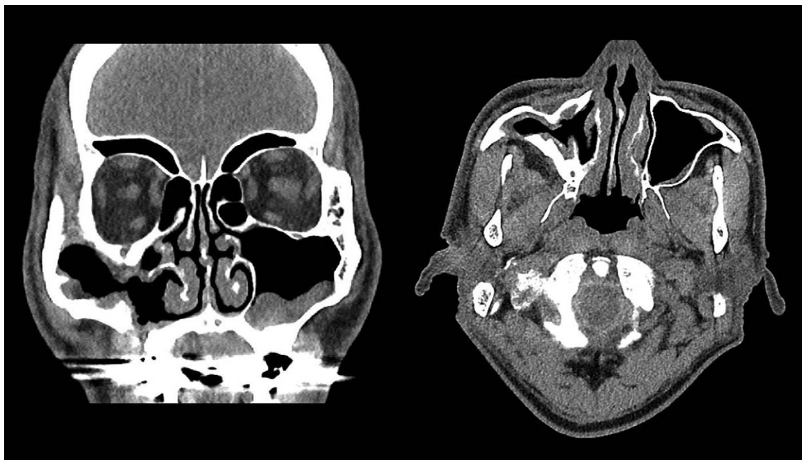
Figure 3. Postoperative computed tomography 3 months after surgery shows the patent opening of antrostomy site.

removed during outpatient treatment. The CT performed 3 months postoperatively showed that the right maxillary sinus was filled with air and the opening of the meatal antrostomy site was good.