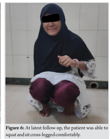
Figure 6: At latest follow-up, the patient was able to squat and sit cross-legged comfortably.