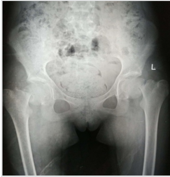
Figure 1: Plain X-ray of the pelvis with both hips: Bilateral displaced femur neck fracture.