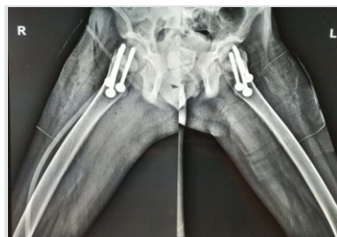
Figure 4: Plain X-ray of the pelvis with both hips (lateral view) showing fracture fixation with three partially threaded cancellous screws.

Follow-up and outcomes: Postoperatively, hips were kept in abducted position with abduction bar. She was kept nil weight-bearing for 3 months. At latest 1-year follow-up, she was able to sit cross-legged and squat [Fig. 5, 6].