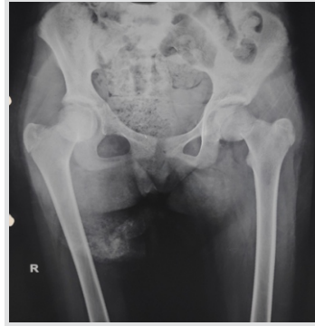
Figure 2: Plain X-ray of the pelvis with both hips traction view.