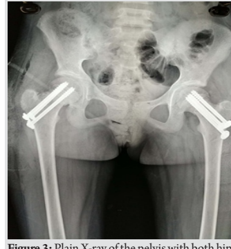
Figure 3: Plain X-ray of the pelvis with both hips (anteroposterior view) showing fracture fixation with three partially threaded cancellous screws.

Radiological examination of hip showed bilateral displaced femur neck fracture (Fig. 1, 2).