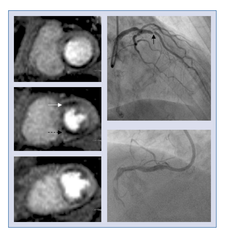
Figure 1. Concordant stress perfusion cardiovascular magnetic resonance (CMR) and fractional flow reserve (FFR) results. CMR imaging (left panel) demonstrating a perfusion defect in the left anterior descending (LAD) artery (e.g. white arrow) and right coronary artery (RCA; e.g. dashed arrow) territories. Coronary angiogram (right panel) demonstrating concordant findings with a severe LAD lesion (FFR 0.58 at baseline and 0.33 at 4 months; black arrow) and an occluded RCA.