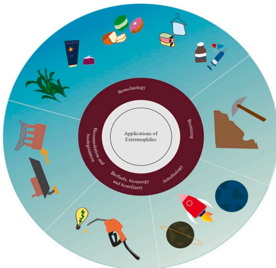
Fig. 2. The different applications of Extremophiles.

in sauces, baby foods, processed cheese, milk products, breakfast cereals, and fruit and energy drinks. Bradyrhizobium sp. and Haloferax alexandrines contain canthaxanthin, which is used as colorants in food and beverages and pigmentation of salmon flesh (López et al., 2021). Microbial food-grade pigments are obtained from Riboflavin in Ashbya Gossypii and carotene in Blakeslea trispora (García-López and Cid, 2016). The microalgal biomass is also utilized to extract carotenoids which serve as dietary supplements. Astaxanthin, obtained from microalgae H. pluvialis and extremophiles from the red snow in Antarctica, is used as a dietary and feed supplement (Torregrosa-Crespo et al., 2018).