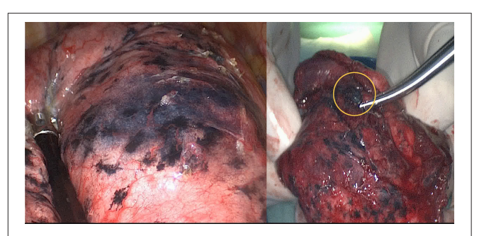
FIGURE 1 | Electromagnetic navigation bronchoscopy-guided methylene blue plus fibrin sealant created a gelatinous appearance with visible stain (left side); the stain kept limited in the resected specimen after 2 h of operation (highlighted in a circle, right side).

In a study by Krimsky et al. 21 patients received thoracoscopic or robotic-assisted thoracic surgery with ENB labeling using either methylene blue (n = 11) or indigo carmine (n =10) regimen (6). Interestingly, 19% of the nodules (n = 4)experienced unsuccessful marking. One patient had diffuse dye marker staining of the parietal pleura and in other three patients, no dye marker was visible within the hemithorax. Similar unsuccessful episodes were seen in Munoz-Largacha et al. (10) and Marino et al. (9), mainly due to extravasation of dye into the pleural cavity or lung parenchyma.