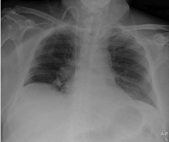
Figure 1: Portable chest X-ray with no pleural effusion after placement of pigtail pleural drain.

thoracotomy or endovascular embolization [5]. In hospitals without thoracic surgeons or interventional radiologists, an emergency thoracotomy may be the only option if the patient is haemodynamically unstable with a massive haemothorax [5]. Even with an open chest, identification and control of the bleeding vessel can be challenging [6].