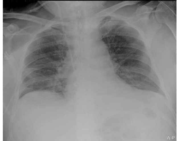
Figure 2: Portable chest X-ray in half-upright position showing haemothorax 4 h after placement of pigtail pleural drain.

A 30° laparoscopy camera was introduced through the thoracotomy and the bleeding site was identified. The skin and subcutaneous tissue were incised directly over the injured artery.