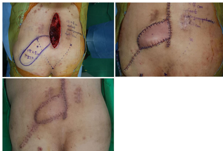
Fig. 2 A patient (age range 50–59 years) with a meningomyelocele defect on the lumbar region. (Upper left) A 10 × 4 cm wound with a vertically oriented cavity, was observed after complete excision of the meningomyelocele. The distal half of the flap was de-epithelized, and inserted into the cavity. (Upper right) After complete inset of the flap, both the recipient and the donor wounds were closed with sutures. (Below) The wound healed without any problems