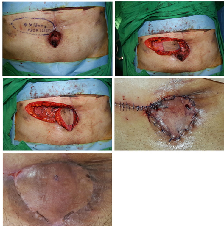
Fig. 3 A patient (age range 30–39 years) with a cutaneous fistula on the lower abdomen. (Upper left) A 4 × 4 cm cutaneous opening with a 9 cm length deep cavity obliquely oriented beneath the pelvic bone, was seen. An island flap was designed near the wound. (Upper right) The portion that would be inserted into the cavity, was de-epithelized. (Center left) The flap was transposed with its intact portion on the opening of the wound, while the de-epithelized portion was placed into the cavity. (Center right) The flap showed temporary congestion, and leech therapy was applied for a short duration. (Below) The wound healed without any problems

monitored directly, its circulatory condition should be assessed based on the monitoring flap.