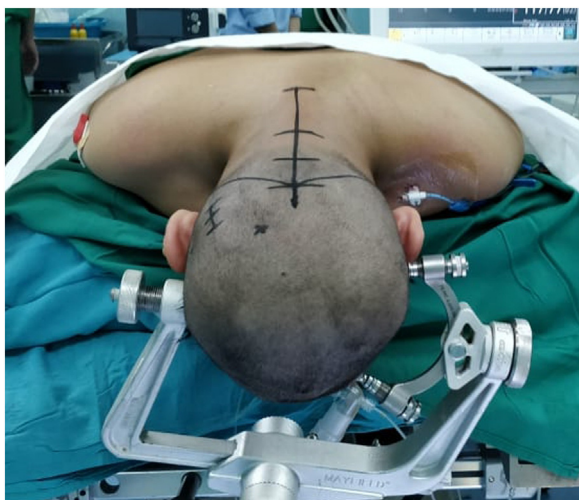
Fig. 1. Mayfield® three-pin skull clamp is applied to the patient's head with prone position.

department. A year before because of visual impairment she was diagnosed with non-communicating hydrocephalus due to the cerebellar tumor in another remote hospital. At that time, the patient's family refused to undergo surgery and never took a further follow up. On the physical examination, GCS was 14 out of 15 with total blindness on both eyes, no cerebellar signs, no motor, and sensory deficit. The CT scan revealed a posterior fossa lesion which caused non-communicating hydrocephalus (Fig. 1).