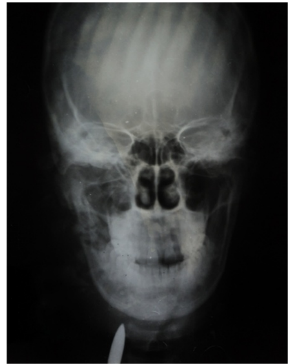
Figure 2 Anteroposterior radiograph of the head and neck. This shows a bullet in the right side of the neck. Comminuted fracture of the mandible (angle and ramus) and maxillary antrum are revealed.

A plain radiograph of her head and neck (Figures 2 and 3) and an ultrasound scan of her neck, done prior to her referral, had revealed the presence of a bullet in the right side of her neck, anterior to cervical vertebrae