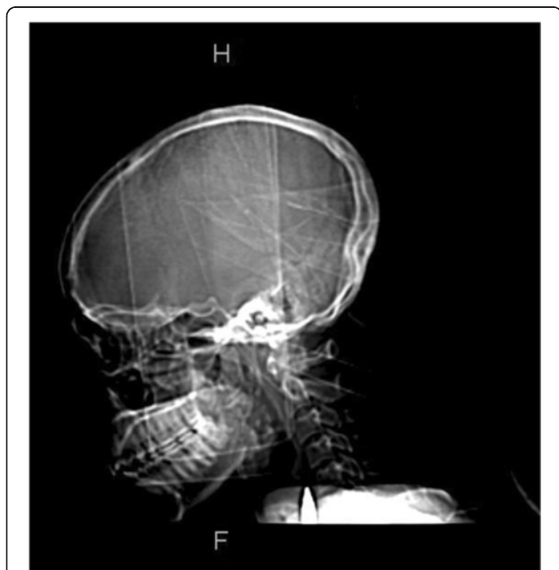
Figure 4 Computed tomography scan of the head and neck. The scan shows a cephalad shift of the bullet to lie partially anterior to the fifth cervical vertebra. There is also a comminuted fracture of the angle and ramus of the right mandible. The section is through the median sagittal plane.

We were faced with a scenario of a GSI to the right side of her head. Given the distance of about 70m, we expected substantial injury; a GSI to the head is often immediately fatal. It was a penetrating type of injury, although avulsion per se was also possible [4]; a 6cm-long wound. What is