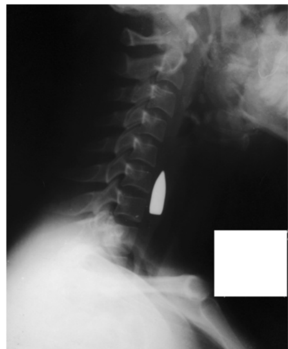
Figure 3 Lateral radiograph of the head and neck. This shows a bullet lodged in the neck, anterior to the bodies of cervical vertebrae 6 and 7.