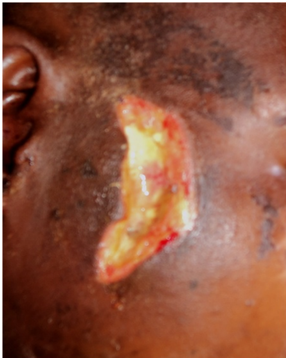
Figure 1 Photograph showing an atypical bullet entry wound. Appearance of the wound 10 days after injury. There is evidence of suppuration and areas of granulation tissue formation.