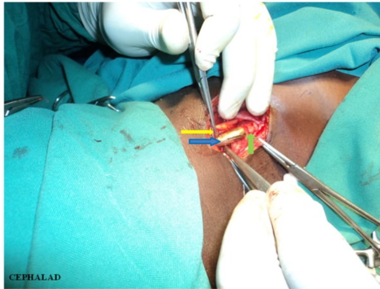
Figure 5 Photograph of bullet extraction. The right carotid sheath is opened exposing the retained bullet (blue arrow). Artery forceps grasp the open carotid sheath (yellow arrow). An intact area of the carotid sheath covering the caudal end of the bullet (green arrow).

not clear concerning the mechanism is the nature of motion, velocity and energy of the bullet at the time of impact with the face. Damage inflicted is proportional to the energy transferred from the missile to the tissues. The following are the possible characteristics of the bullet at impact: a direct bullet 'hit', a ricocheting bullet (indirect), or a 'falling' bullet. More specifically a direct 'hit' could be either 'head-on' or 'broadside-on', whereas a ricocheting bullet would have come off another object, with partial loss of energy depending on the density of the object