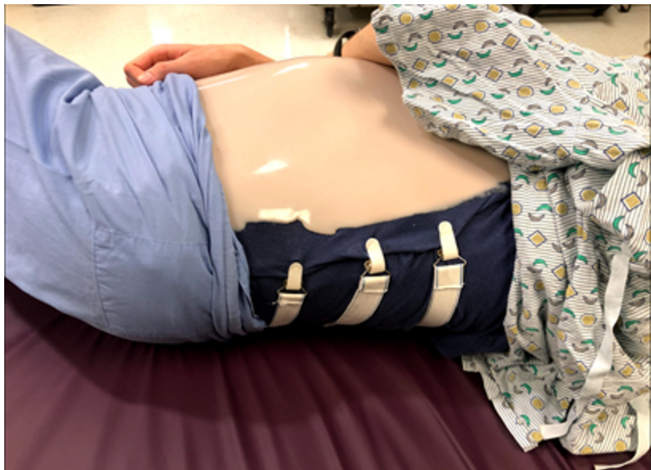
FIGURE 6: Model abdomen strapped around human volunteer

An external cephalic version simulation was conducted using the model among OB/GYN residents at various stages in their education. The pillowcase-uterus model was placed around a human volunteer to simulate a pregnant patient who was in need of an ECV. Prior to using the model, residents were first given a lecture on ECV with important information such as instructions on how to conduct the procedure, important statistics about procedure outcomes, how best to counsel patients on the risks and benefits of the procedure, how to determine when ECV is necessary, and other considerable alternatives to the procedure. After the lecture, residents were given the opportunity to attempt an ECV on the simulated pregnant patient model (Figure 7).