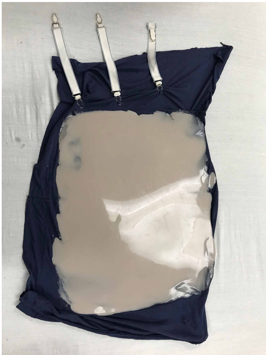
FIGURE 3: Model abdomen: pillowcase with applied Dragon Skin™ and mattress straps attached