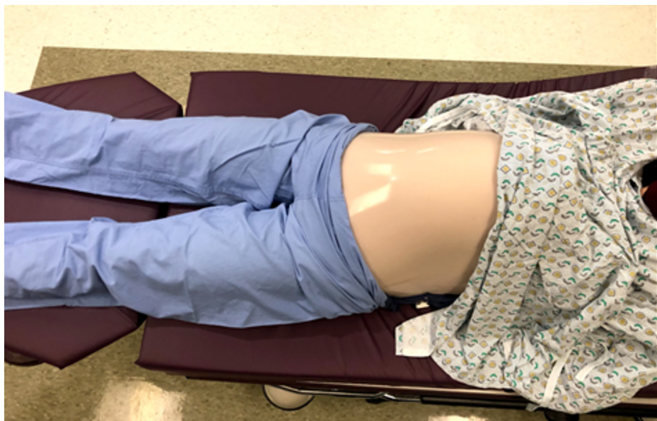
FIGURE 7: Simulated pregnant patient model