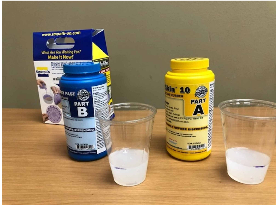
FIGURE 1: Dragon Skin Smooth-On Silicone™

Dragon Skin silicone™ were applied onto the front of the pillowcase until the desired thickness and surface area was achieved (Figure 3). To best replicate human skin and give the model a more realistic appearance, coloring using Smooth-On Silc Pig™ was applied with a toothpick during the mixing of each silicone layer before application. Each layer of Smooth-On silicone™ was applied using tongue depressors. The hardening time for each layer was approximately 30 minutes.