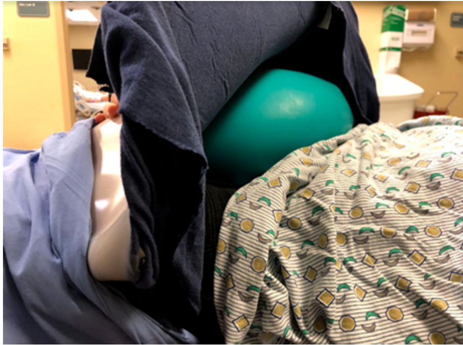
FIGURE 5: Balloon placed under model abdomen on human volunteer