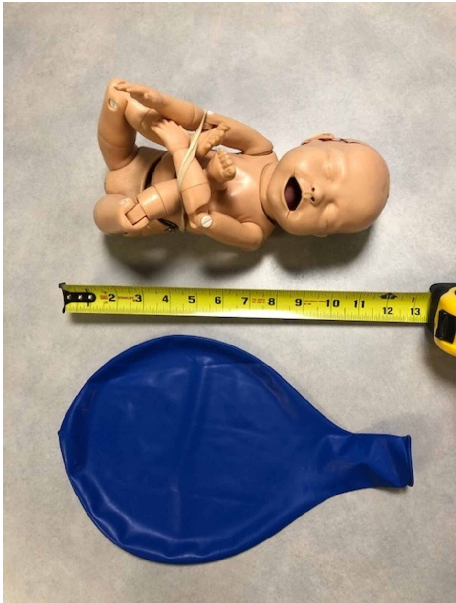
FIGURE 2: Model baby and 7-inch diameter balloon