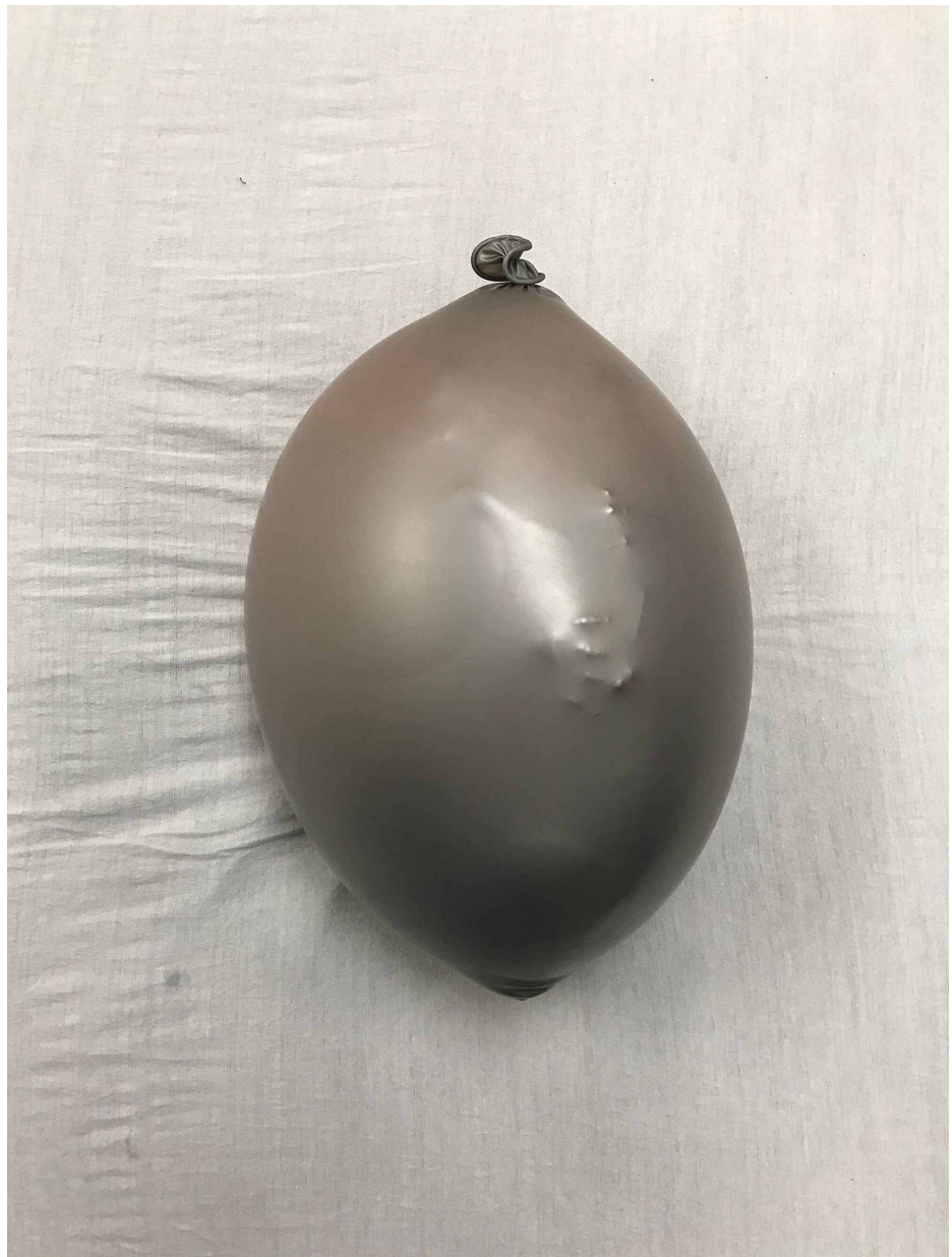
FIGURE 4: Model uterus: model baby within three balloons