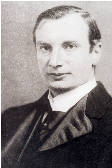
Fig. 2. Waldemar Haffkine (1860–1930). Physician and scientist born in Odessa who studied zoology at the University of Odessa under the supervision of Elie Metchnikoff. Haffkine joined the Parisian laboratory of Metchnikoff at Institut Pasteur in 1890 and developed the first effective cholera vaccine. In 1893–1894, he was offered the possibility to organize a cholera vaccination campaign in various regions of India where epidemics of cholera were prevalent by Lord Dufferin (Viceroy of India from 1884 to 1888 and Ambassador of Great Britain in Paris). Back in India in 1897, Haffkine produced a plague vaccine composed of killed germs to combat the bubonic plague epidemic.