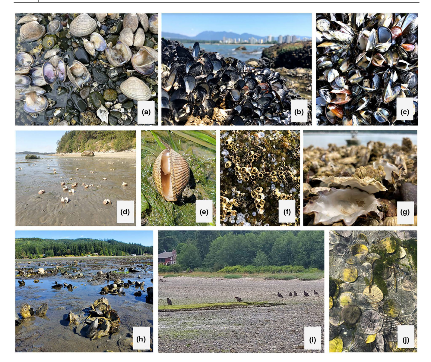
FIGURE 1 Scenes of invertebrate mortality post 26–28 June heatwave. (a) Dead Manila clams ( Ruditapes philippinarum ). (b) Dead and empty bay mussels ( Mytilus spp.). (c) Dead Mytilus spp. (d) Empty and clean cockle ( Clinocardium nuttallii ). (e) Gaping cockle ( C. nuttallii ). (f) Mixed bed of dead barnacles ( Balanus glandula and Chthamalus dalli ). (g) Empty and clean Pacific oysters ( Crassostrea gigas ). (h) A healthy Olympia oyster ( Ostrea lurida ). (i) Turkey vultures foraging on tidelands in Sequim Bay, WA, following the heatwave event. (j) Sand dollars ( Dendraster excentricus ) turning yellow a week following the heatwave event. Detailed descriptions, locations, and credits can be found in Appendix S1.

of collaborators to rapidly assess the postheatwave condition of nearshore invertebrates across the coastal Pacific Northwest and inland waters of Washington state and British Columbia known collectively as the Salish Sea (e.g., Strait of Juan de Fuca, Puget Sound, and the Strait of Georgia). Our goal was to inventory shellfish condition observations across a broad geographic scale to document the effects of the extreme heatwave and to serve as a starting point for future detailed quantitative research and monitoring. We asked local scientists (academic, tribal, and state and federal agencies) to rate shellfish condition in terms of the degree of postheatwave