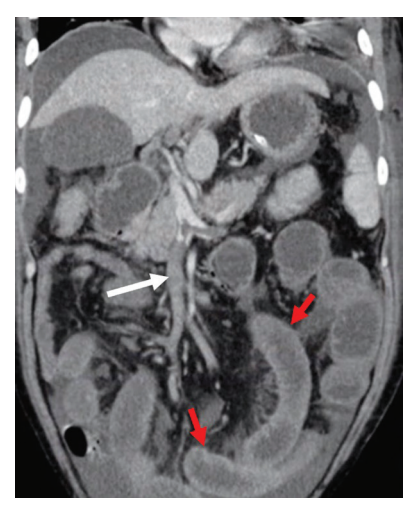
Fig. 2: A 72-year-old ICU patient with COVID-19. Coronal CECT image showing superior mesenteric venous (SMV) thrombosis (white arrow) with small bowel wall thickening (red arrows), mesenteric stranding and mild ascites, indicating early bowel ischemia

GB with thickened wall, decrease in wall enhancement sludge within the lumen with or without pericholecystic fluid.<sup>7</sup> Few case reports have also described the occurrence of gangrenous cholecystitis in patients with COVID-19, although the exact pathophysiology is unknown.<sup>8</sup>