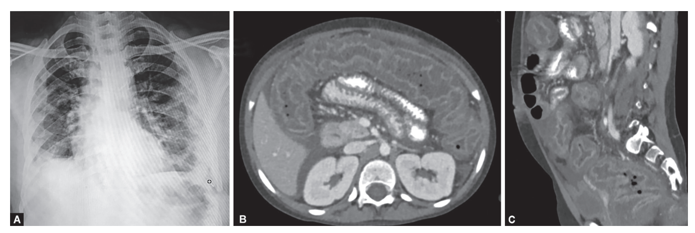
Figs 3A to C: A 69-year ICU patient presented with abdominal pain and diarrhea. (A) Chest X-ray shows peripheral subpleural GGOs in both lungs (left > right) with lower zone predominance, typical of COVID-19 pneumonia; (B) axial and (C) sagittal CECT images showing marked diffuse edematous thickening of large bowel with enhancing mucosa, giving "accordion sign." Mild ascites is also noted