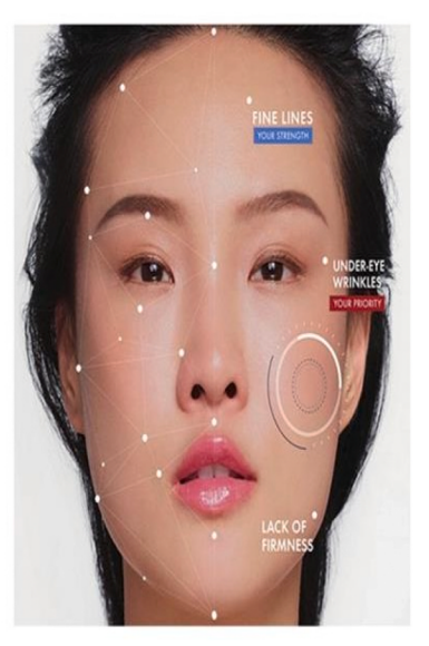
Fig. 2. Examples of three different AI-powered virtual artist applications (Multivu, 2017; de Jesus, 2020; L'Oréal, 2019).