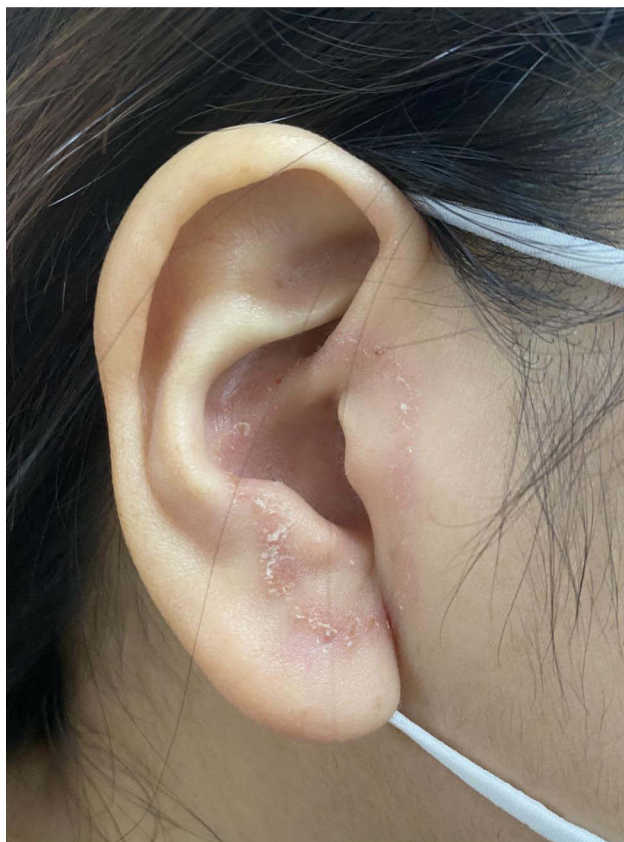
Figure 1 Annular erythema on the right ear.