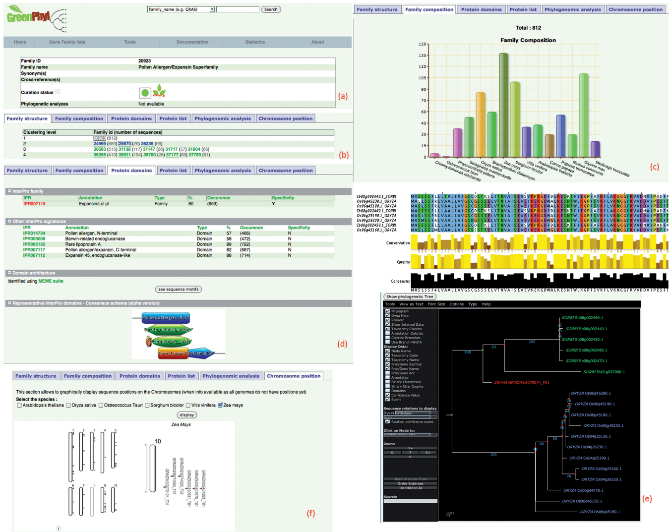
Figure 2. Global overview of the family entry page for the Pollen Allergen/Expansin Superfamily (fid = 20923). (a) At a glance, users can view that the family is curated (green light) and is plant specific. (b) Annotated gene families at the different levels are underlined. Gene families are colored in blue when the phylogenetic analyses are being performed. Here, three gene families are annotated at level 2 (names pop up when you mouse-over) and two of them were analyzed (gene tree and orthologs are available). (c) This superfamily contains genes from 15 out of the 16 species. Indeed, there is no representative in the Cyanidioschyzon merolae , a red algae and a large expansion is predicted starting in the embryophytes. (d) The Expansin/Lol pI InterPro family entry is specific to the Pollen Allergen/Expansin Superfamily. Several other representative domains are listed and graphically represented in a consensus schema. (e) Multiple alignment and gene tree Java applets (Jalview and Archeopteryx) including orthology scores can be launched. (f) Gene positions on several genomes are available using GViewer. A zoom on chromosome 10 of Zea mays is visible.

interPro. Finally, as it may be informative to graphically view the position of specific protein patterns for a given gene family, we also implemented a consensus pattern graphical view of gene families, based on the Prosite MyDomains Image Creator (39).