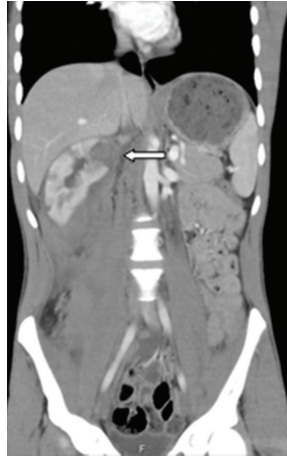
FIGURE 1: Contrast enhanced computed tomography of the patient where multiple infarcts can be seen in right kidney (arrows).