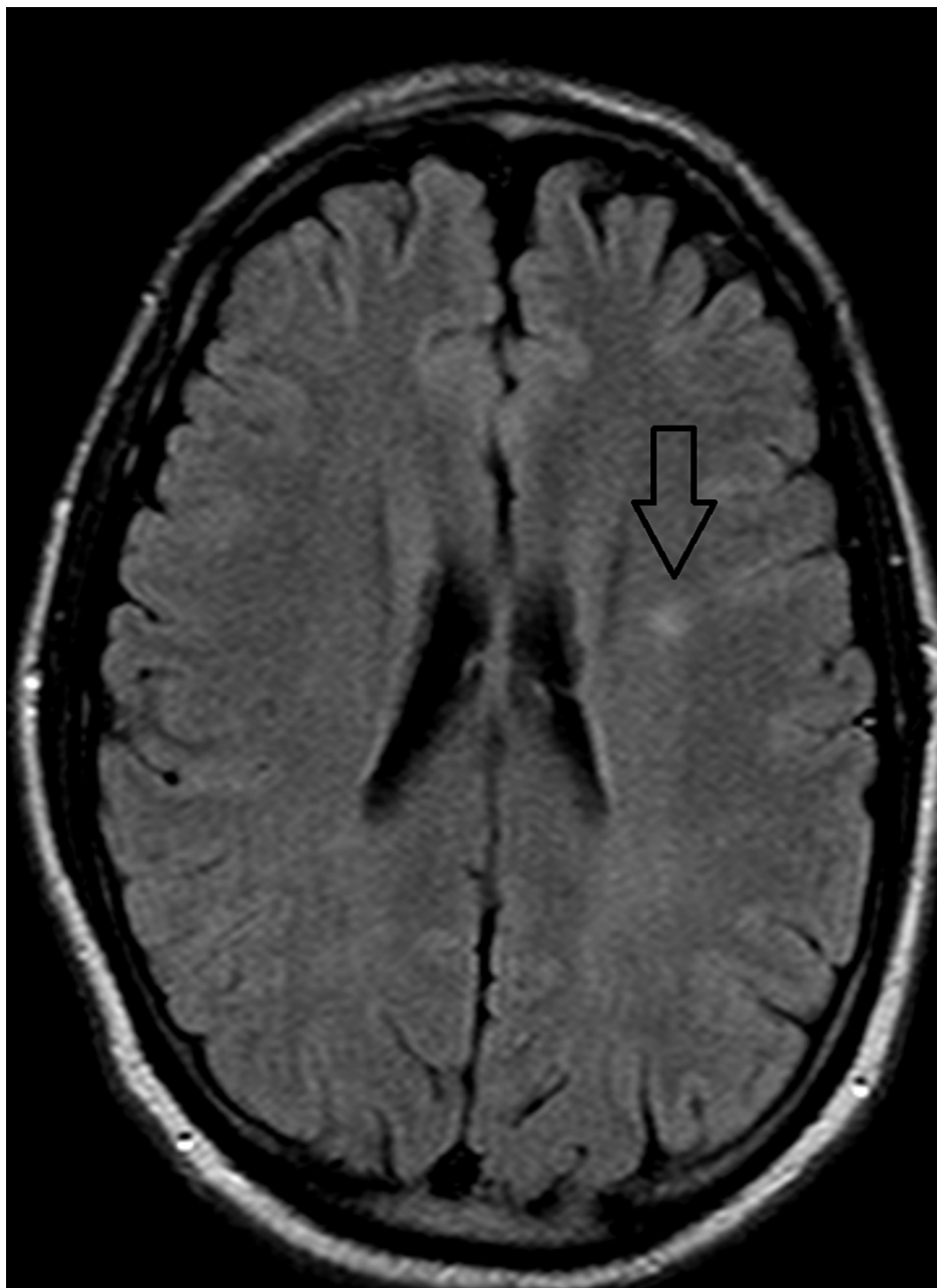
FIGURE 3: MRI of the head shows a small nonspecific focus of increased signal intensity in the left posterior frontal periventricular white matter, possibly representing a small focus of demyelination, chronic ischemia, or gliosis

The patient's mentation improved with supportive treatment. Subsequent EKGs performed did not show QTC prolongation; however, the patient's sodium level decreased to 129 mmol/L. Urine/serum osmolality and urine electrolytes were performed to evaluate for his worsening hyponatremia. Serum osmolality was 264 mosm/kg, with a urine sodium level of 110 mmol/L, urine chloride of 97 mmol/L, and urine osmolality 601 of mosm/kg, which suggests syndrome of inappropriate anti-diuretic hormone (SIADH). Urinalysis showed a specific gravity of 1.020.