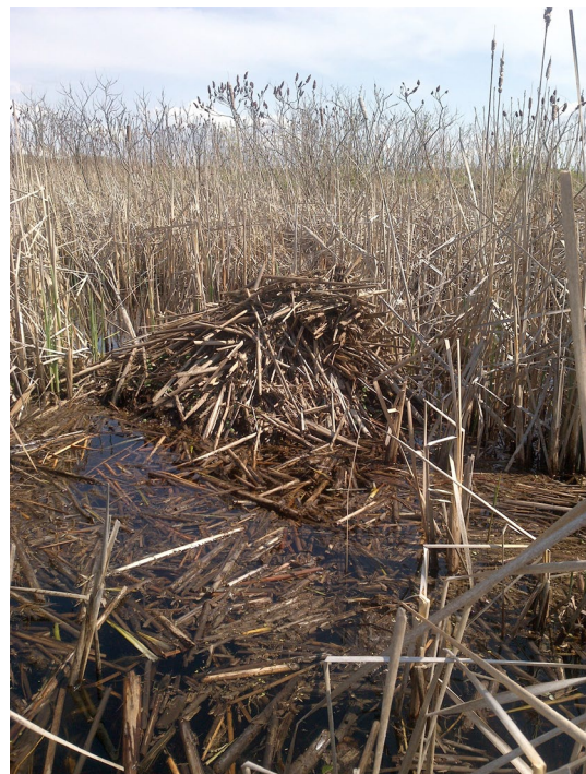
FIGURE 3 Muskrat house found during our survey of the Matchedash Bay–Gray Marsh in May 2018

At Pelee, we conducted surveys the first 2 yrs in winter (March 2014 and February 2015) on foot with two observers walking on the ice along the inner edge of all marsh areas (i.e., the perimeter of mapped ponds, plus small channels and accessible pools) within