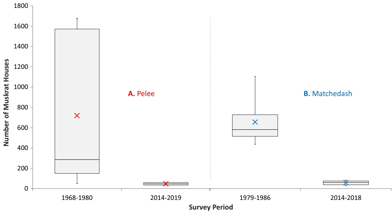
FIGURE 5 Box plots of annual muskrat house counts at A. Point Pelee (consistently surveyed zones and years only) and B. Matchedash Bay for each survey period. The horizontal line inside each box represents the median house count, and the mean count for each is denoted by an X. Lower and upper box boundaries represent the 25th and 75th percentiles of the data, respectively. Whiskers denote the minimum and maximum house counts. Estimated maximum counts were used to compute the results for the contemporary survey period at each site

and Heske (2017) called for direct evidence of muskrat population trends to avoid confounds with harvest effort, and we provide such evidence here.