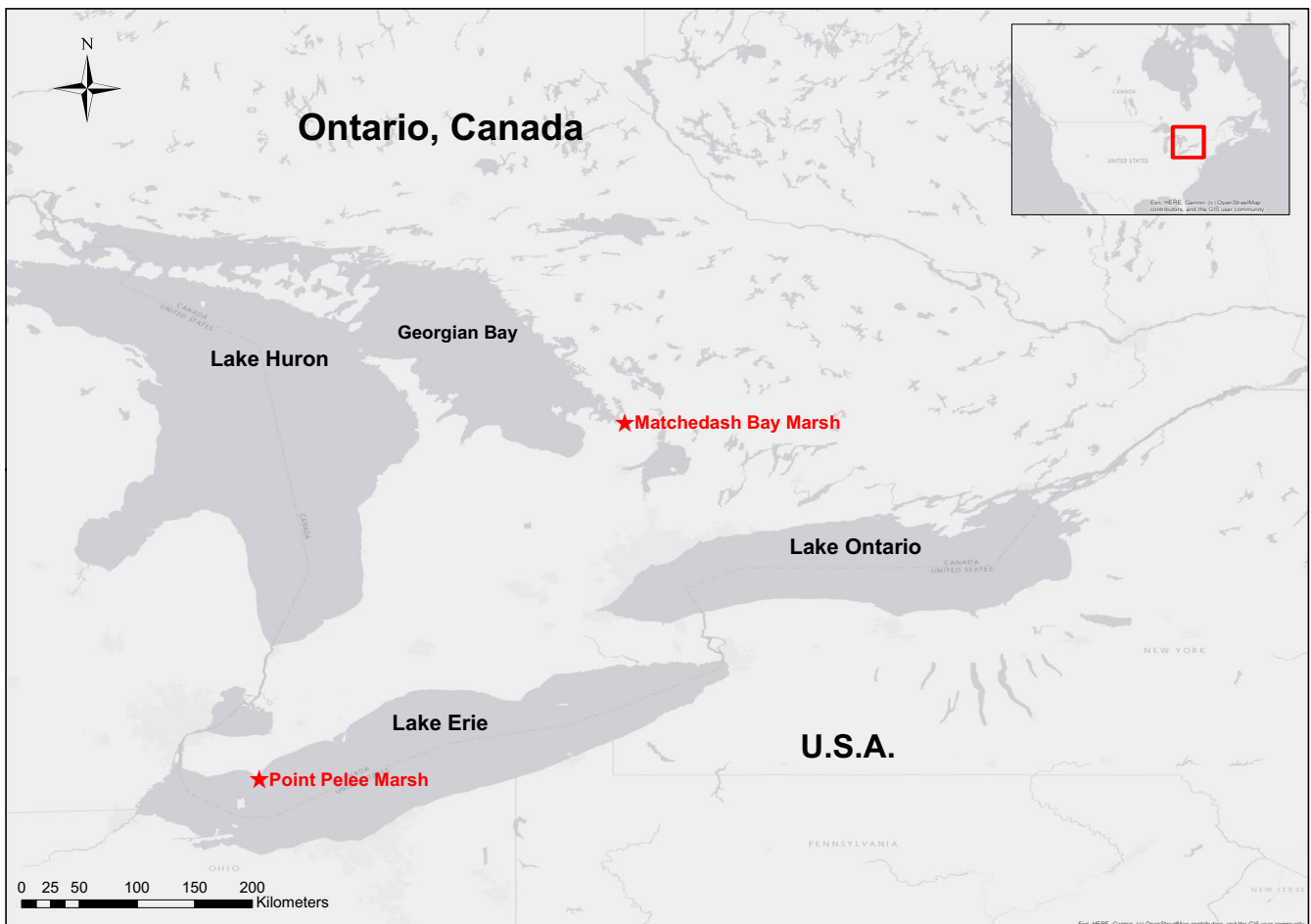
FIGURE 2 Study sites for historic and contemporary muskrat surveys in Ontario, Canada

We found two sites in Ontario with collections of multi-year historic muskrat survey data from coastal wetlands: Point Pelee National Park and Matchedash Bay–Gray Marsh (Figure 2). In both cases, the historic data were more than 30 yrs old. The methods and data from these surveys are published in internal government reports, and we were able to obtain copies from the respective offices responsible for the resource management of these sites. We replicated the historic muskrat surveys in the marshes of these two locations between 2014 and 2019. Both sites are considered Great Lakes coastal wetlands but are of different hydrogeomorphic types; the Point Pelee Marsh is classified as a barrier-beach wetland, while the Matchedash Bay complex is classified as a combination of protected embayment and drowned river mouth wetlands (Albert et al., 2005). These two sites are situated on different Great Lakes and are separated geographically by a straight-line distance of 385 km.