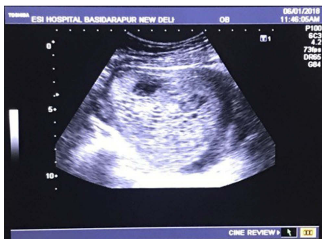
Figure 1 TVS (Transvaginal sonography) picture of the patient showing a snowstorm appearance.