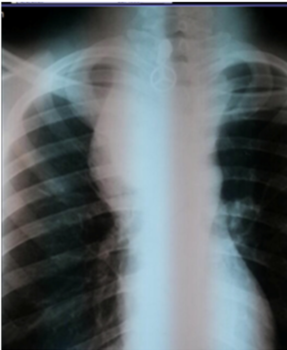
Fig. 1. CXR on presentation, showing a huge right paratracheal mass obstructing the airways.

roundings, resected, and the innominate artery's lateral wall was repaired at the origin of the right common carotid artery. The distal end of the subclavian artery was arising from the far end of the pseudoaneurysm. We ligated the distal end of the right subclavian artery. Postoperatively, history was taken from the patient. He had a penetrating chest injury by a sheep horn in the right infraclavicular region 15 years prior to presentation. The patient's postoperative course was uneventful, and his respiratory symptoms resolved. The right upper limb was properly functioning, and CT angiography showed excellent filling of the right subclavian artery from the collateral circulation. Pseudoaneurysm of the innominate artery should be suspected as a rare complication in chest trauma.