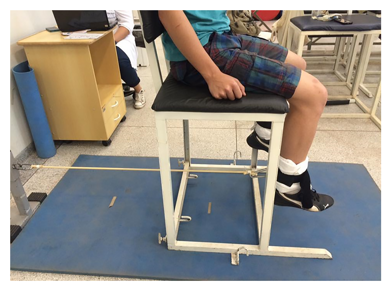
Fig 3. Positioning to perform the test.

https://doi.org/10.1371/journal.pone.0203259.g003