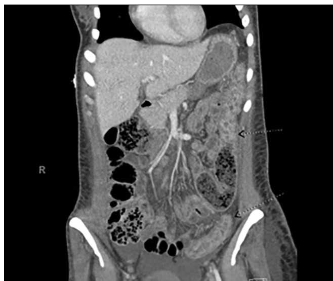
Figure 2. Computed tomography showing inflammatory changes and wall thickening from the distal ileum to the large bowel including the distal transverse colon and rectum.