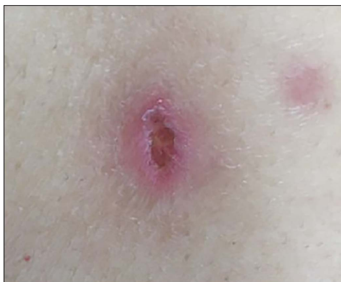
Figure 1. Pathergy findings were present at peripheral intravenous sites.

Initial laboratories indicated anemia, leukocytosis, and elevated C-reactive protein. Infectious workup was negative for Clostridioides difficile , hepatitis B virus, syphilis, human immunodeficiency virus, yeast, Trichomonas , Chlamydia/Neisseria , herpes simplex virus 1/2, cytomegalovirus, and varicella-zoster virus. Computed tomography showed inflammatory changes and wall thickening from the distal ileum through the large bowel, including the distal transverse colon and rectum (Figure 2).