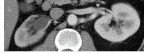
FIGURE 3: CAT scan axial view shows hydronephrosis (arrow) in right kidney.

Methylprednisolone was changed to oral prednisone and Methotrexate 15 mg/week was also added to management. Prednisone was gradually tapered down. He was discharged home since presenting symptom resolved to continue low