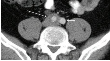
FIGURE 1: CAT scan axial view shows mural segmental thickening in common iliac artery (large arrow) and hydronephrosis (small arrow).