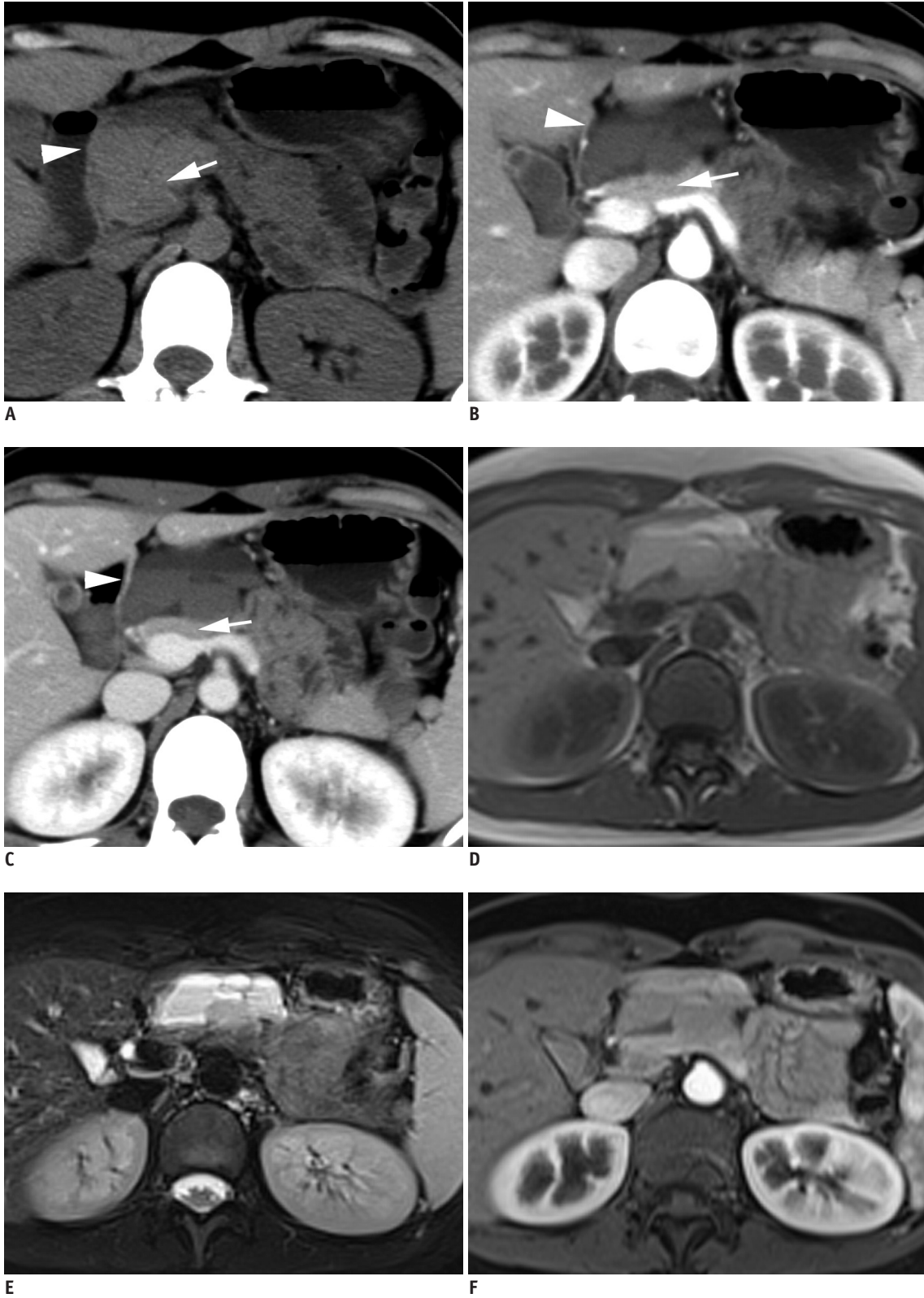
Fig. 1. Twenty three-year-old woman with pancreatic hemangioma.

(A) Plain CT scan of abdomen shows heterogeneous, well-defined mass (arrowhead) at pancreatic head (arrow). Enhanced CT scan at arterial phase (B) and at portal vein phase (C) shows mass has no enhancement and is multilocular cyst with fluid-fluid levels (arrowhead). The pancreas (arrow) shows obvious enhancement. Superior fluid layer shows low attenuation of fluid and inferior fluid layer shows higher attenuation. Superior fluid layer shows hyper SI on T1WI (D) and T2WI with fat suppression (E). Inferior fluid layer is slightly hyper SI to pancreas on T1WI (D) and hypo SI relative to superior fluid layer on T2WI with fat suppression (E). Mass shows no enhancement after injection of contrast material (F).