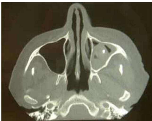
Figure 2. TC of face presenting thickening of the mucous covering of the maxillary sinus left and mass of density of soft parts with calcifications.