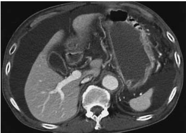
Fig. 1. CT of the abdomen showing massive ascites and normal-sized liver and spleen.

Esophagogastroduodenoscopy (EGD) disclosed no evidence of portal hypertension such as esophageal varices or gastropathy. A laparoscopic biopsy of the peritoneum and liver was performed to rule out any common cause of high protein, low SAAG ascites such as peritoneal malignancies, tuberculosis or infections. Laparoscopy showed that the surface of the liver was slightly irregular and the peritoneum was normal in appearance. A microscopic examination of the liver biopsy revealed accumulations of yellow bile pigment in the hepatocytes, suggesting intrahepatic cholestasis without findings of liver cirrhosis (Fig. 2). Histology of the peritoneum yielded non-specific findings.