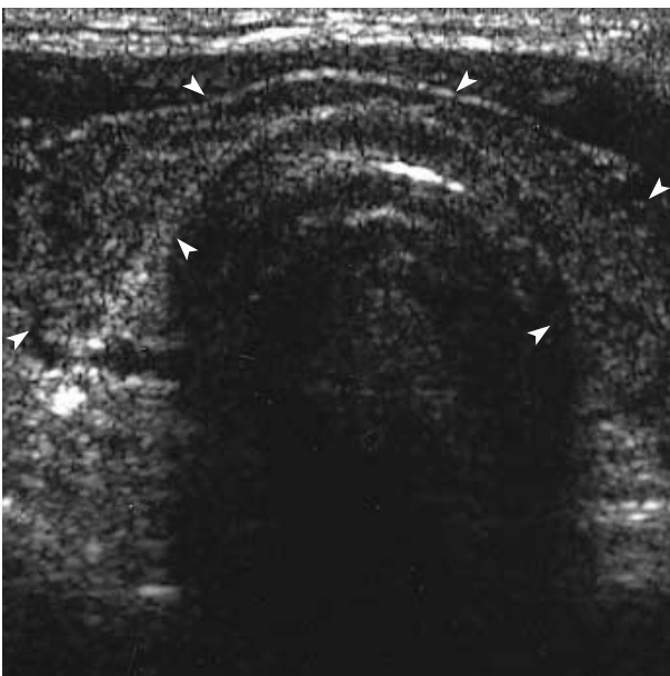
Fig. 3. Thyroid ultrasonograph revealing atrophic change of both thyroid lobes (arrowheads).