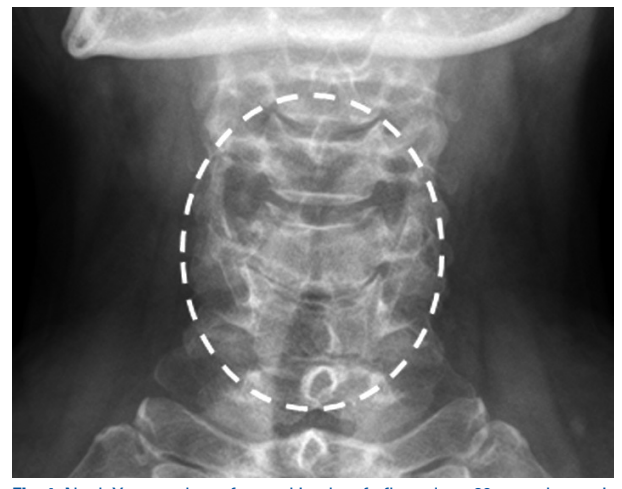
Fig. 1. Neck X-rays taken after oral intake of afloqualone 20 mg, when stridor and hoarseness were present, show supraglottic airway narrowing.

A 62-year-old woman visited the emergency room with