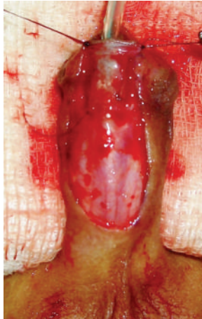
FIGURE 6: Perimeatal based flap applied to form neourethra.