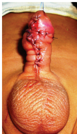
FIGURE 7: Mathieu's procedure completed.

the group-B. Complications do occur after every hypospadias repair. Currently there is expected complication rate of 5–10% mostly fistulas in one stage urethroplasty [14] (Table 3).