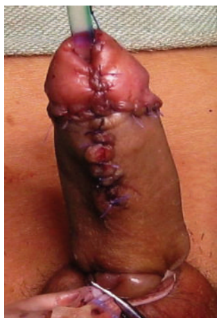
FIGURE 4: Snodgrass procedure completed.