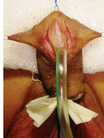
FIGURE 2: Tubularized incised plate urethroplasty.

with a knife in the urethral plate. The neourethra was reconstructed around 6 or 8 Fr catheter using multiple interrupted sutures with polygalactin 6-0 with knots outside. Glanuloplasty was performed with 6-0 polygalactin in two layers. Meatoplasty and skin cover were completed (Figures 1, 2, 3, and 4).