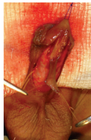
FIGURE 5: Perimeatal based flap in Mathieu's procedure.

On follow-up the cosmetic appearance of the penis was excellent in all the patients (100%) in group-A; in group-B excellent cosmesis was achieved in 20 (41.66%) patients. In group-B 8 (16.7%) patients had mild torsion of the shaft. This difference was statistically significant between the two groups ( P < 0.05 ). The shape of meatus was slit like and vertically oriented in 48 (92.3%) patients who had undergone TIP repair.