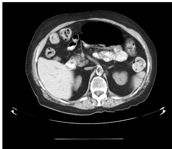
Figure 3. CT coronal image demonstrating cecal volvulus.

was prepared for emergency exploratory laparotomy. Purulent ascites effused from the abdominal cavity immediately upon entry and was evacuated with suction irrigation. Gangrenous cecal volvulus was promptly diagnosed. Multiple cholesterol gallstones were found embedded within a dense mesenteric cicatrix causing ileocolic torsion. Mesenteric venous outflow was obstructed with he-