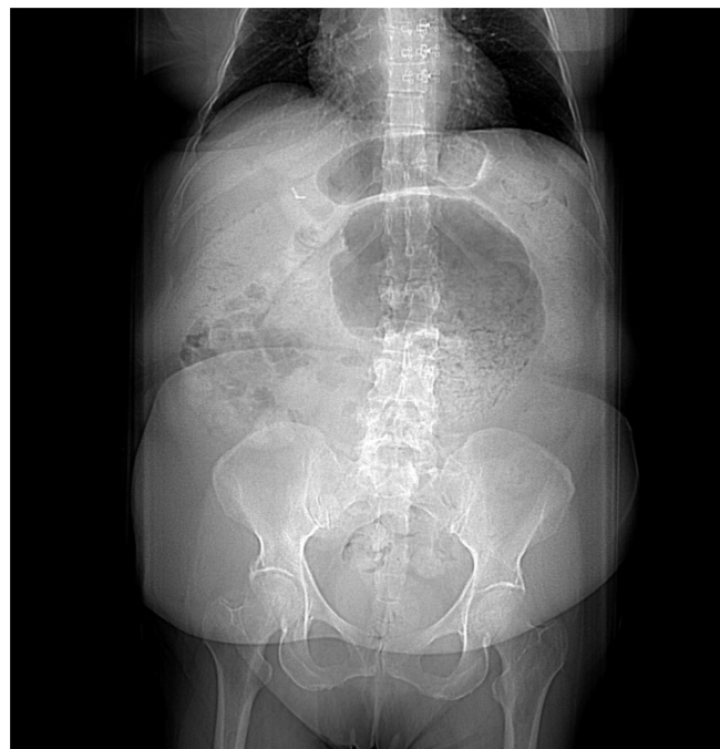
Figure 2. CT scout film demonstrating “coffee bean” sign.

Carbapenem antibiotics were initiated, and fluid resuscitation was started with bolused crystalloid as the patient