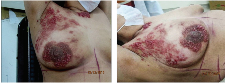
FIGURE 1: Multiple subcutaneous nodules on the right chest wall.