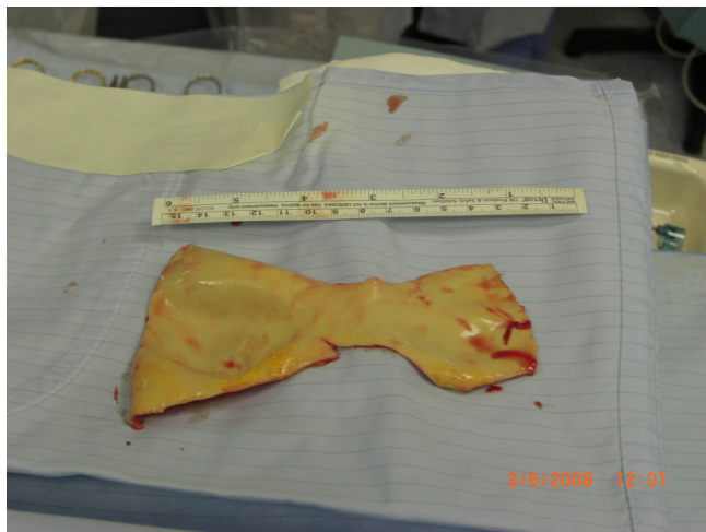
Figure 2 macroscopic specimen of the aorta's intima.

Operations were performed through a median sternotomy after isolation of the right axillary artery at the deltoideus-pectoralis groove. After systemic heparinization, a