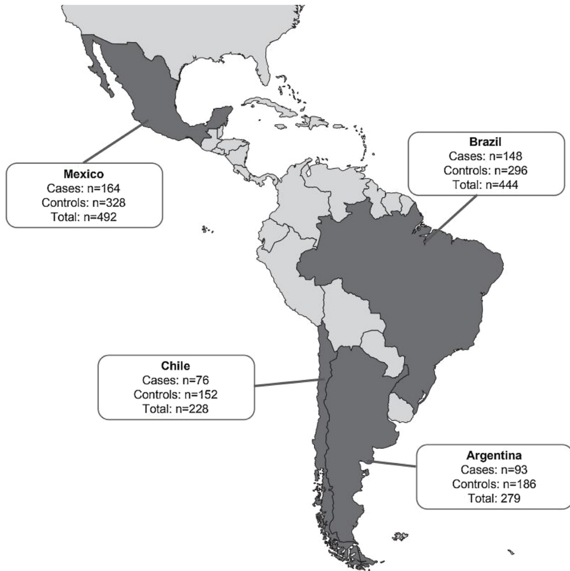
Fig. 2 – Patient distribution by country.

whereas patient admission from an emergency department was more common in the control group (21.7%; 209/962) than among cases (12.7%; 61/481) [ p < 0.001 ].