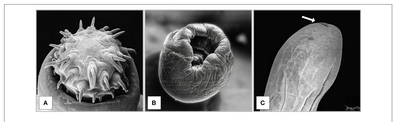
FIGURE 1 | SEM observation of M. hirudinaceus : Cephalic region (A); Copulatory bursa of male (B); Caudal region of female (C), and genital pore (arrow).

The histopathology of the nodules in the small intestine showed severe damage of the tissue with an intense inflammatory