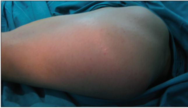
Figure 1: There was a firm, non-tender mass of 10 × 8 cm in diameter on the posterolateral aspect of the shoulder