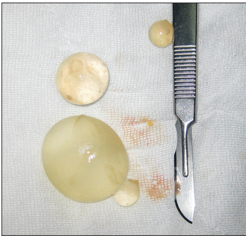
Figure 3: The mother and daughter cysts of the hydatid cyst were seen extracted in the surgery

(constant score was 88). There was no inferior subluxation due to deltoid insufficiency.